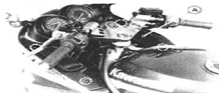
A. Inner Fairing