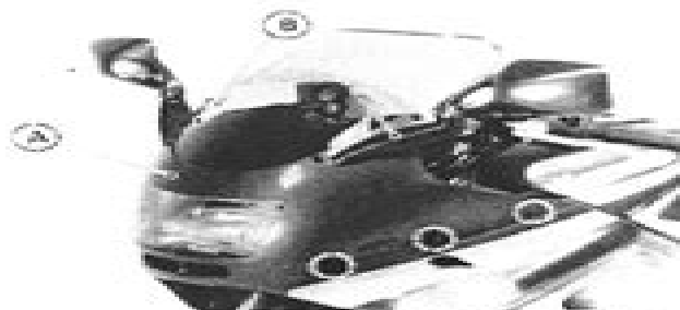
A. Upper Fairing