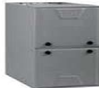
Illustrations and photographs are only representative. Some product models may vary.