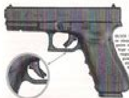
GLOCK MB Ambidextrous magazine release

The dimensions of the pistols are given in mm. * Dimensions of the pistols are given in mm. * Dimensions of the pistols are given in mm. * Dimensions of the pistols are given in mm.