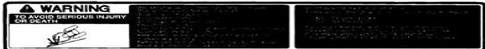
(2) Part No. K3211-6582-2