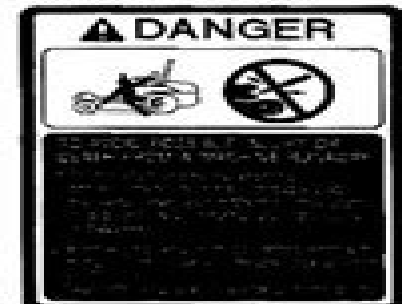
(2) Part No. K3211-6583-1