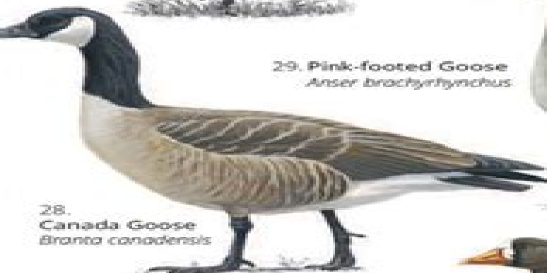
28. Canada Goose Branta canadensis