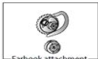
Earhook attachment (not supplied in all regions)