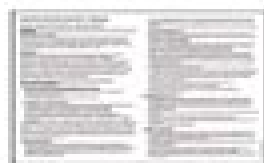
Warning & Declaration booklet