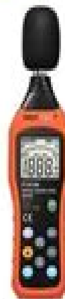
Sound Level Meter