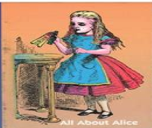
All About Alice