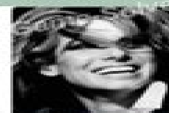
Sandra Bullock Sandra Bullock