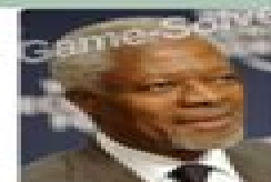
Kofi Annan Kofi Annan