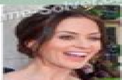
Emily Blunt Emily Blunt