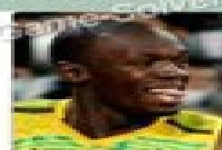
Usain Bolt Usain Bolt