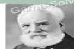
Alexander Graham Bell Alexander Graham Bell