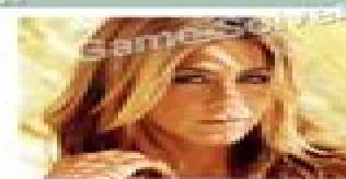
Jennifer Aniston Jennifer Aniston