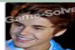
Justin Bieber Justin Bieber