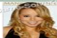
Mariah Carey Mariah Carey