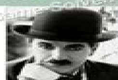
Charlie Chaplin Charlie Chaplin