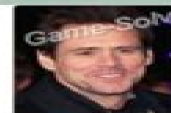
Jim Carrey Jim Carrey