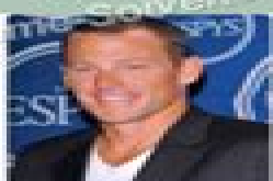
Lance Armstrong Lance Armstrong