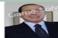
Silvio Berlusconi Silvio Berlusconi