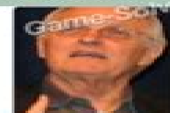
Alan Alda Alan Alda