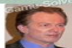
Tony Blair Tony Blair