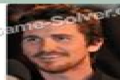
Gareth Bale Gareth Bale