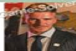
David Beckham David Beckham