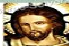
Jesus Christ Jesus Christ