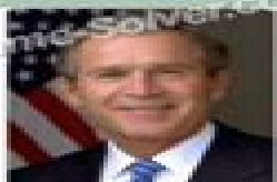
George W. Bush George W. Bush