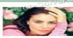
Monica Bellucci Monica Bellucci