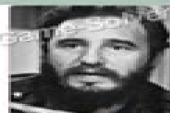
Fidel Castro Fidel Castro