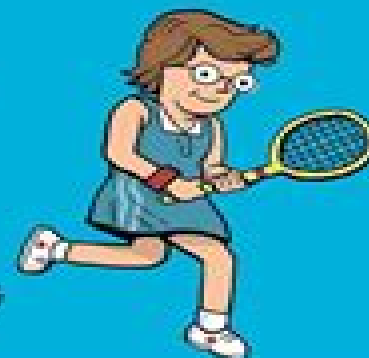
BILLIE JEAN KING