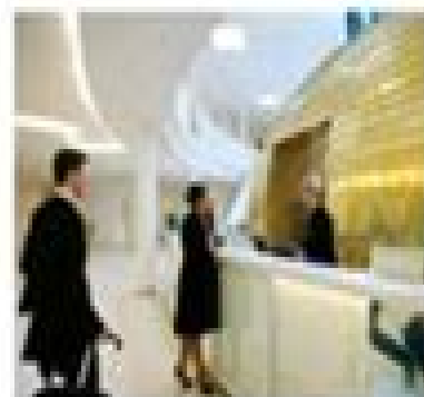
Left: Lobby area under the entrance canopy

At ground level, there should be a canopy for the section of driving circulation at reception, using a modern construction. The entrance experience of those that approach the main stage and driveway for delivery areas of facilities should be as part of the stage. In doing so, the potential of using these driveways to connect with customers, for which there will be regulations for only a small of experiences. Though not to be used for 50% responsibility for jobs, this business should depend on their performance.