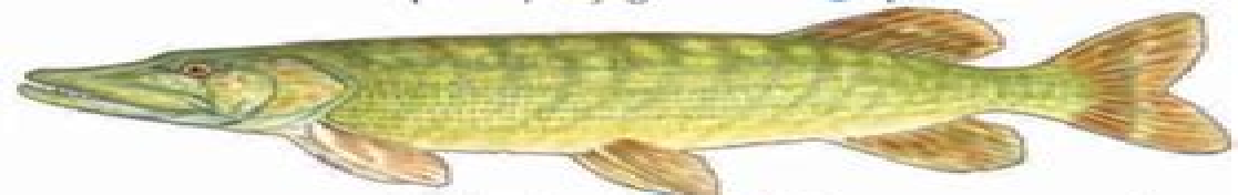
35. Pike Esax lucius 50-150 cm