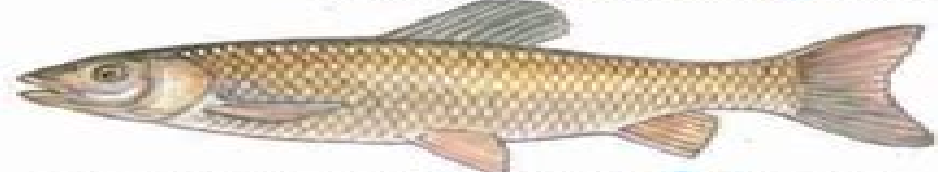
34. Grass Carp Ctenopharyngodon idella Up to 125 cm