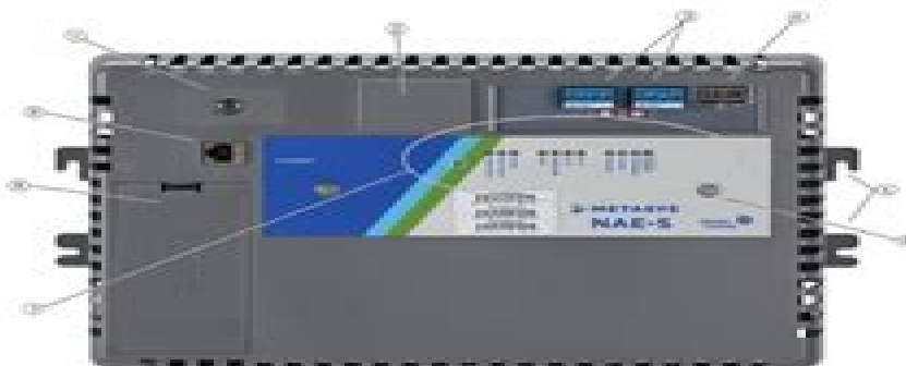
Table 1: Secure Network Engine physical features