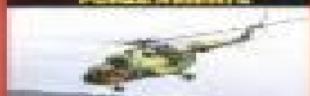
IL DRACONIANE MACCHINARI