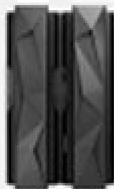
IBM z13 ®