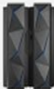
IBM z14 ®