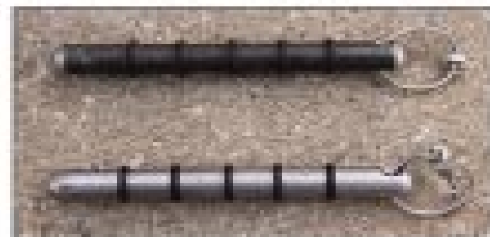
Personal Keyring Kubotan that looks innocuous.