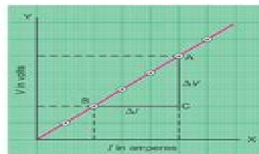
Fig. 4.1 Graph between V and I

Here A is ammeter, K is plug key, R_h is rheostat, V is voltmeter and R is resistance.