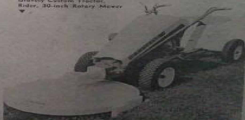
Gravelly Custom Tractor, Rider, 30-inch Rotary Mower

GRAVELY TRACTOR DIVISION Studebaker CORPORATION HAROLD, ILLINOIS 61841 U.S.A.