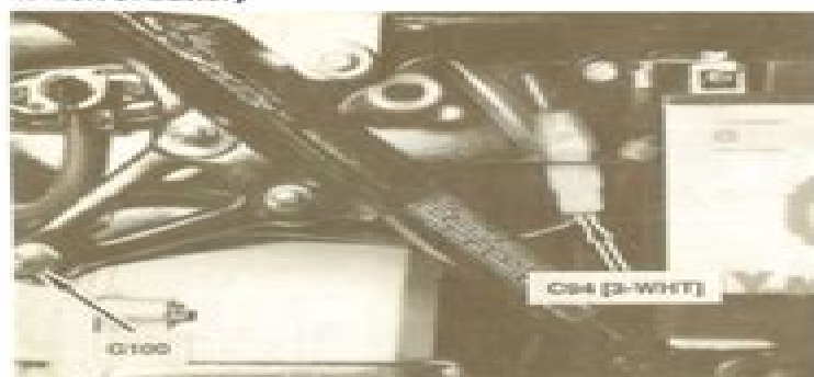
1. Left of Battery