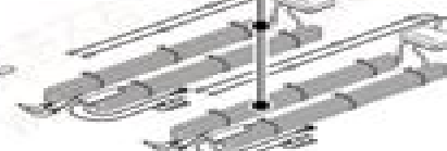
Cord with connector (E30-4953-05)