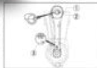
Fig. 12 (A) Crankshaft (B) Camshaft (C) Crankshaft (D) Crankshaft