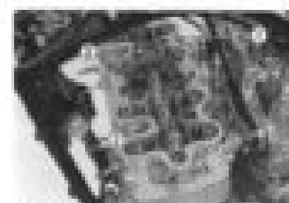
Fig. 13 (A) Direct pin (B) Timing rollers