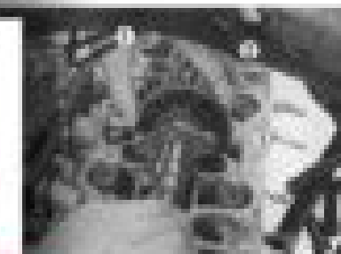
Fig. 11 (A) Cam chain (B) Cam chain

Mount the cam chain assembly on the cylinder head with the adjustment.