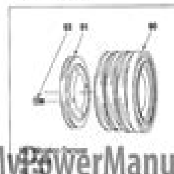
Figure 75: Crankshaft Damper and Pulley