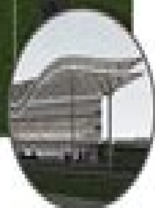
Double Roof Canopy