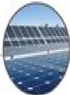
Solar PV Panels