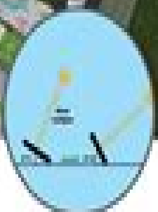
Best Energy-saving Angle