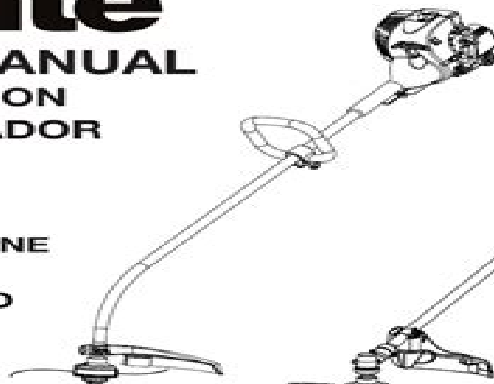
MightyLite 26CS UT21004/UT29005

ALL VERSIONS TOUTES LES VERSIONS TODAS LAS VERSIONES