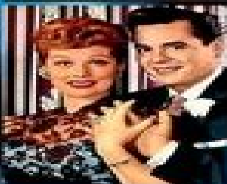
Lucille Ball & Desi Arnaz

A TRIBUTE TO THE GLORY DAYS OF ENTERTAINMENT & THE WAY WE WERE