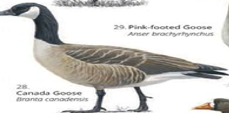
28. Canada Goose Branta canadensis