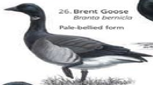
26. Brent Goose Branta bernicla Pale-bellied form