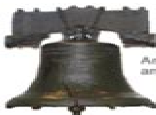
American History and Geography