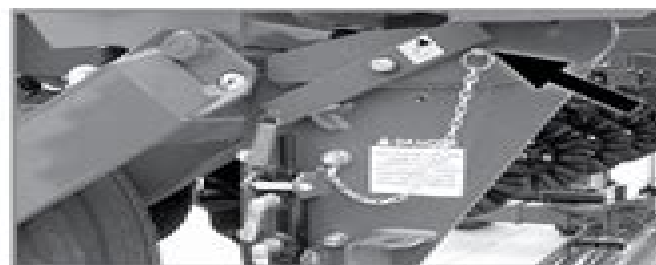
Transport latch locking pin installed