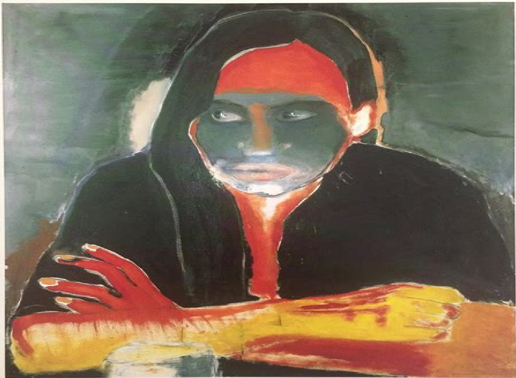
MARLENE DUMAS \ INTIMATE RELATIONS