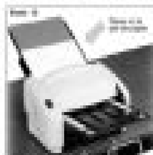
Figure 1 Top view of the machine showing the paper tray