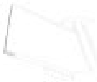
Figure 2 Internal view of the machine

1. The machine is designed to fold paper of the following sizes: 11" x 17" (A4) 11" x 14" (A5) 11" x 10" (A6) 11" x 8" (A7)