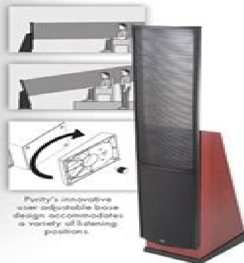
Purity's innovative user adjustable base design accommodates a variety of listening positions.

Visit configurator.martinlogan.com to explore the full range of finish options.