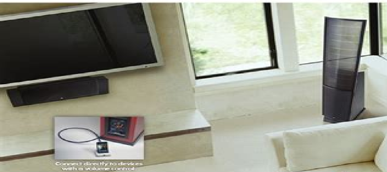
Connect directly to devices with a volume control.