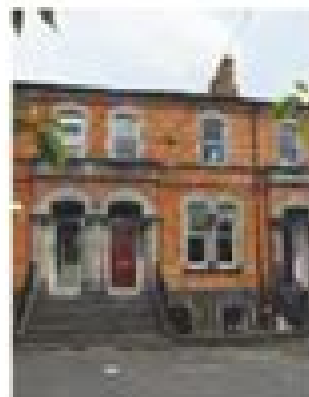
1.27 Victorian architecture tended to be more conservative in form, but the use of contrasting materials such as brick and different stone provided scope for more extensive architectural expression.

Queen Victoria's accession to the throne in 1837 coincided with a remarkable period of industrial