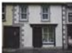
1.28 The 18th century also saw the development of pattern book design and guide with thousands available all the upper floors. Cheapness in materials, stone and village, stone or otherwise, was common and a lot of neoclassical elements.

It was during this period that mass built, affordable housing emerged for the first time, with one of designers led to mass and semi-detached