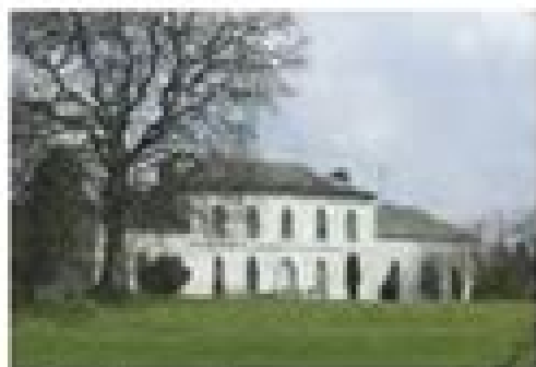
1.28 Georgian style houses throughout Ireland in the early 18th century often used features typical of windows and doorways in a neoclassical manner.