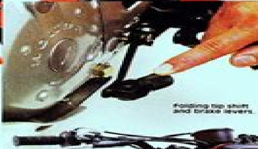
Folding top shift and brake levers.