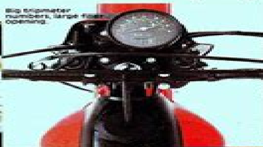
Big tripmeter numbers, large finger opening.