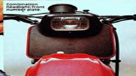
Combination headlight, front number plate.