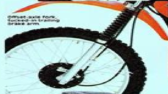
Offset-axis fork, tucked-in trailing brake arm.