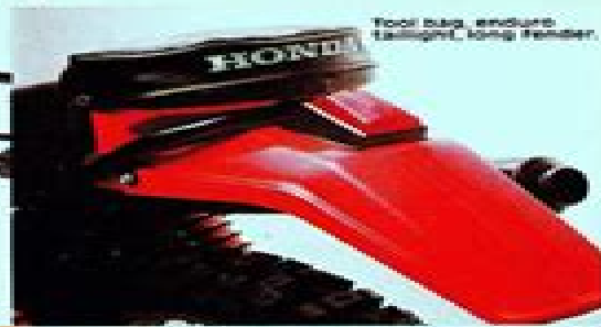
Tool bag, enduro taillight, long fender.