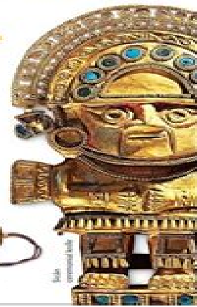
Large ceremonial mask