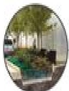
Low Impact Development