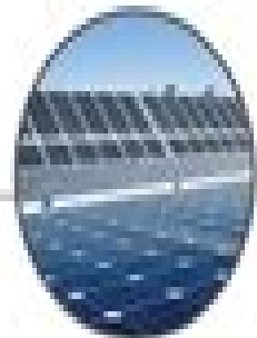
Solar PV Panels