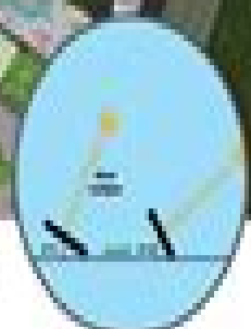
Best Energy-saving Angle