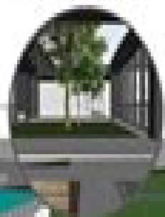
Adaptive Comfort & Natural Ventilation