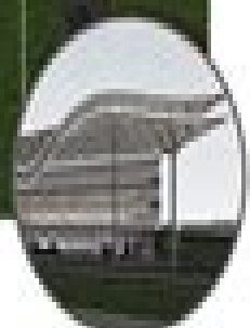
Double floor Canopy