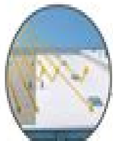
White Cool Roof